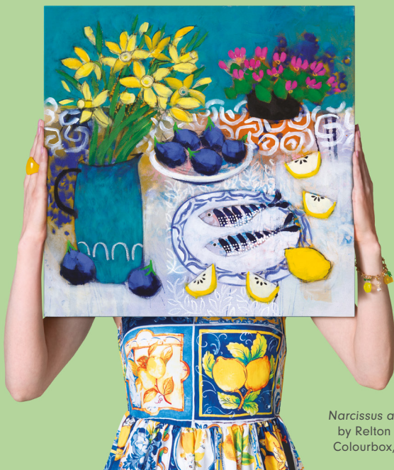
Narcissus and Figs by Relton Marine Colourbox, £2,950