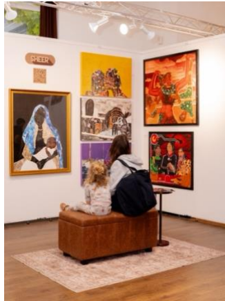
Affordable Art Fair New York City, Fall 2024.

The Fellowship Program offers emerging New York and Tri-State arts organizations the opportunity to scale their business and grow their audience by participating in Affordable Art Fair NYC free of charge for three consecutive editions.